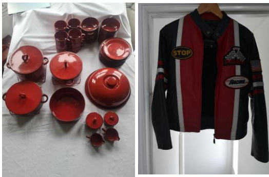
Festive Crockery Set £50 ono Motorcycle Jacket £40.00

Adverts will be posted in each newsletter and will be available to view on the company website at www.invitari.co.uk . See below for this months feature ads.