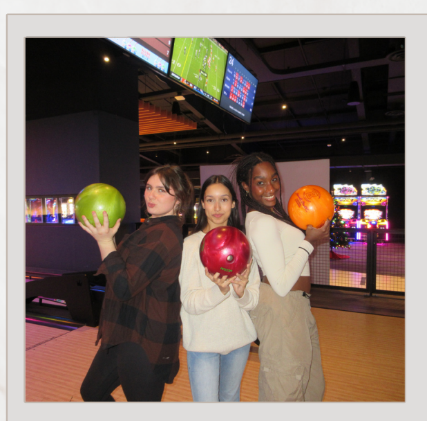
FOSSA Winter Bowling Social!