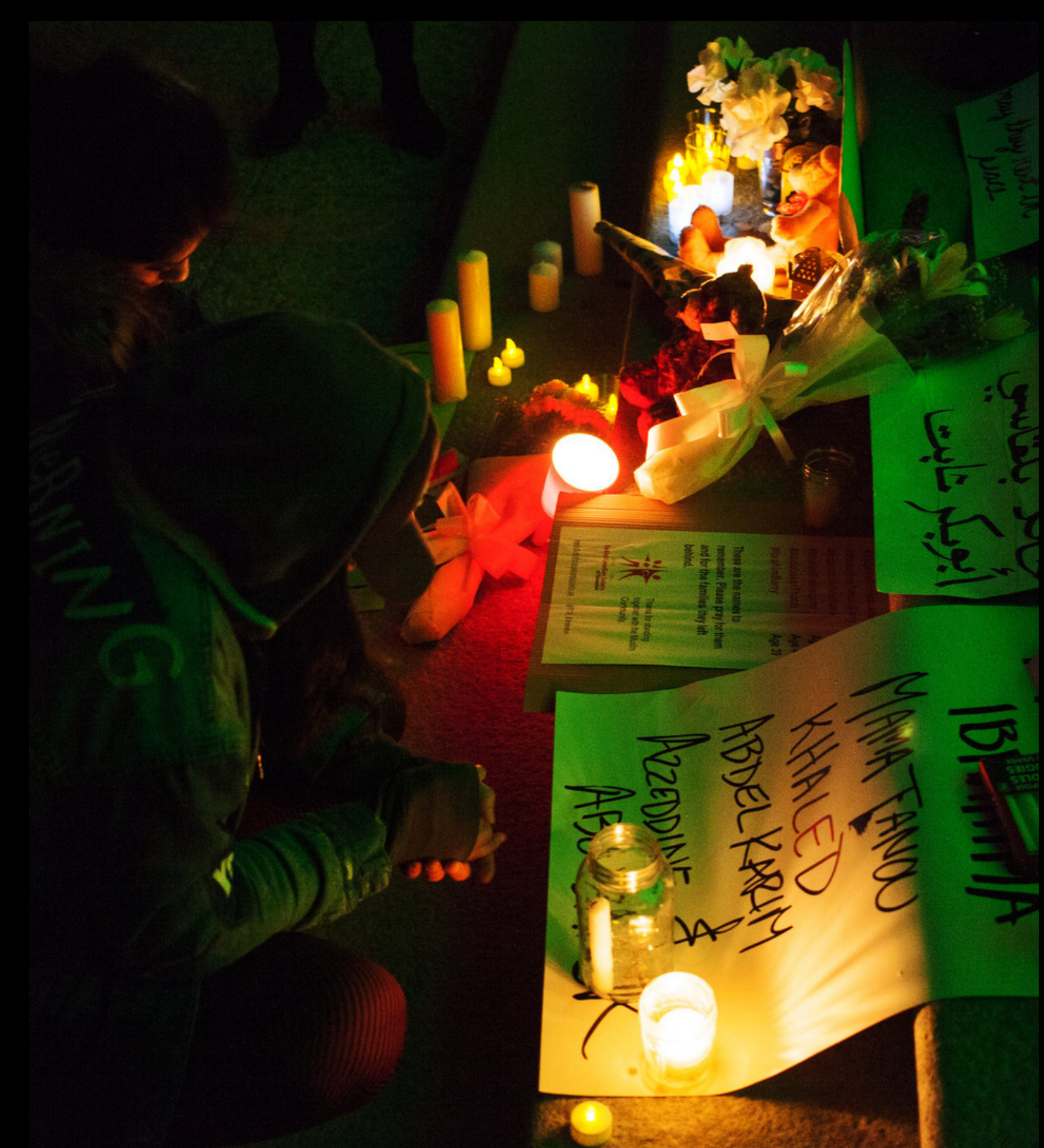
QUEBEC CITY MOSQUE ATTACK, NATIONAL REMEMBRANCE DAY COMMEMORATED ON JANUARY 29TH - A HARROWING EVENT THAT SHOOK CANADA AND THE WORLD, REMAINS A SOLEMN REMINDER OF THE FRAGILITY OF PEACE AND THE DESTRUCTIVE NATURE OF HATE. IT SERVES AS A POIGNANT CALL FOR UNITY, TOLERANCE, AND THE REJECTION OF VIOLENCE, URGING COMMUNITIES TO STAND TOGETHER AGAINST BIGOTRY. AS WE REMEMBER THE LIVES LOST AND AFFECTED, THE ATTACK UNDERSCORES THE ENDURING NEED FOR VIGILANCE IN PROTECTING AND CHERISHING THE VALUES OF DIVERSITY AND INCLUSIVITY.