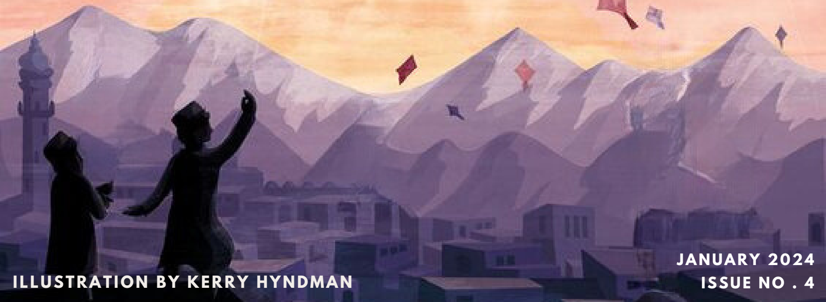
ILLUSTRATION BY KERRY HYNDMAN