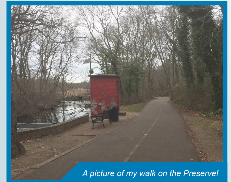
A picture of my walk on the Preserve!

Unfortunately, the governor extended the state of emergency here in New York. This means our New York salespeople can't come back to work yet. Some of the salespeople went to work in New Jersey but for a few, it is just too far. I think he won't lift this state of emergency till after the vaccine is distributed.