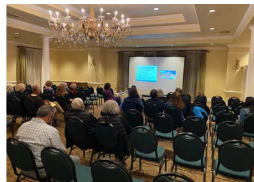
Residents gathered at our Town Hall with county on zoning