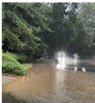
Overflowing on El Nido on to golf course

The "atmospheric river" that we experienced in October reminded all of us that climate change is upon us and will be presenting new dimensions in weather from now on. Because this was the first huge storm to hit the Bay Area in 2021 after a long drought, we learned where we were well prepared and where we needed improvement for the future.