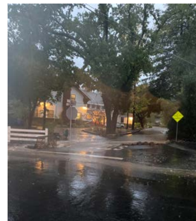
Water over flowing the culvert over the road at El Centro and Avenida Nueva