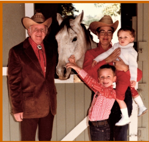
The Batts family in 1979