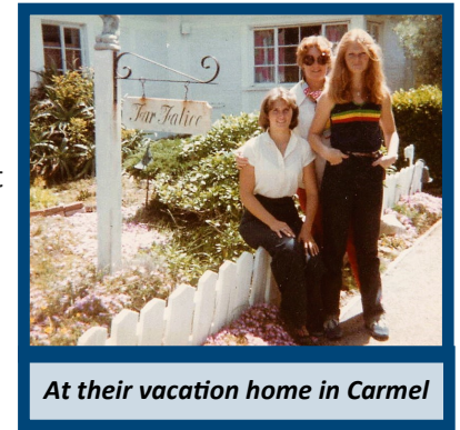
At their vacation home in Carmel