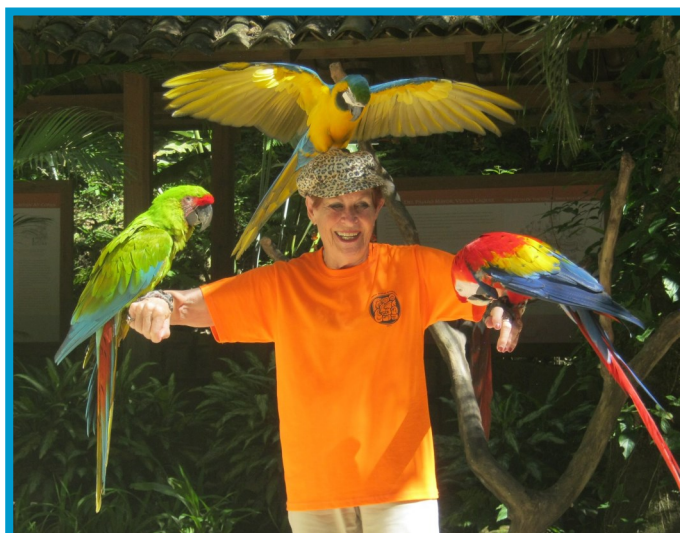
Celebrating her 80th birthday in Guatemala