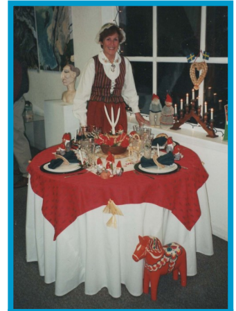
Sharing her Swedish heritage