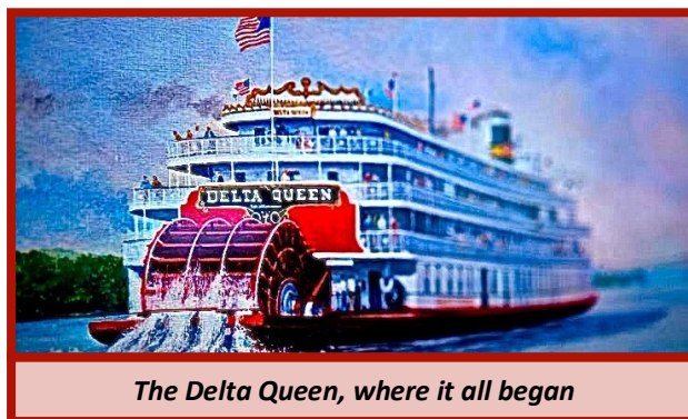
The Delta Queen, where it all began