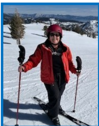
Ute in Tahoe