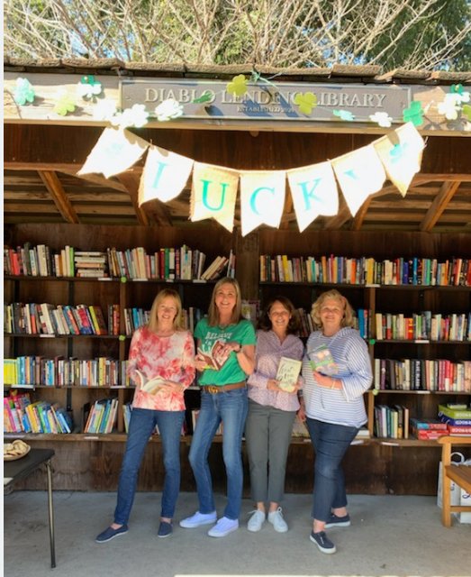
Book Club Event, March 16th

Fun things happening at our Diablo Lending Library!