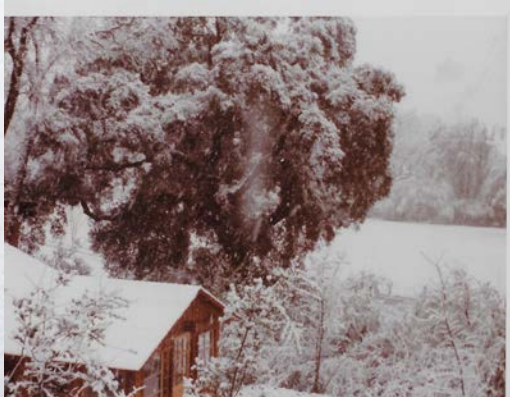
Diablo CC 18th Fairway and Oak covered with Snow