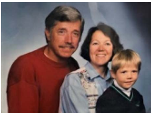
The Medford Family