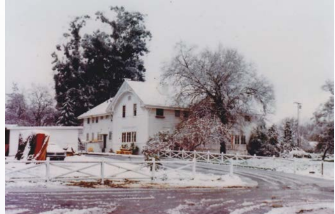
Red Horse Apartments