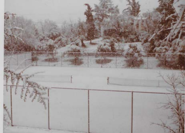
Tennis courts with La Cava Home in Background