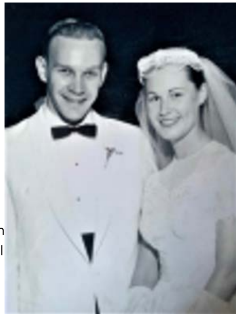
Wedding Day, 1957