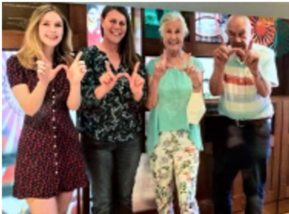
Five generations of Wisconsin Badgers