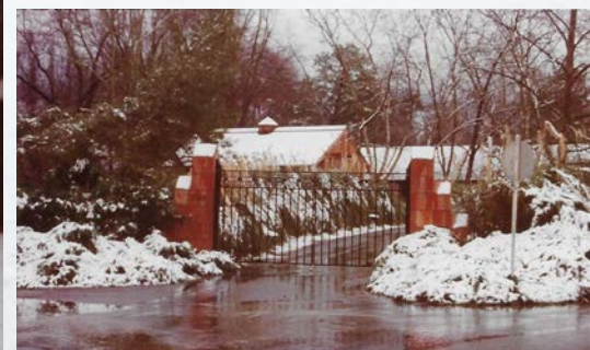
Penny Adam's Calle Los Callados home