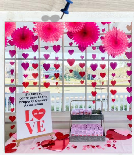
Valentine's Day and Love Diablo Display at Post Office