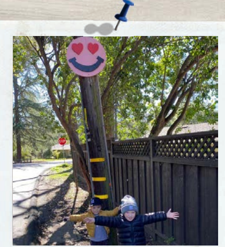
Aspland boys finding happy faces in Diablo