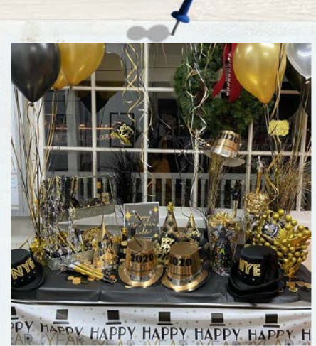
New Year's Eve celebration at the Post Office from DPOA