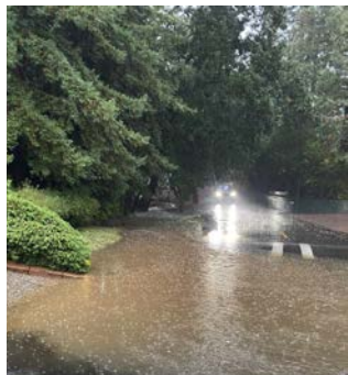
Overflowing on El Nido on to golf course

The "atmospheric river" that we experienced in October reminded all of us that climate change is upon us and will be presenting new dimensions in weather from now on. Because this was the first huge storm to hit the Bay Area in 2021 after a long drought, we learned where we were well prepared and where we needed improvement for the future.