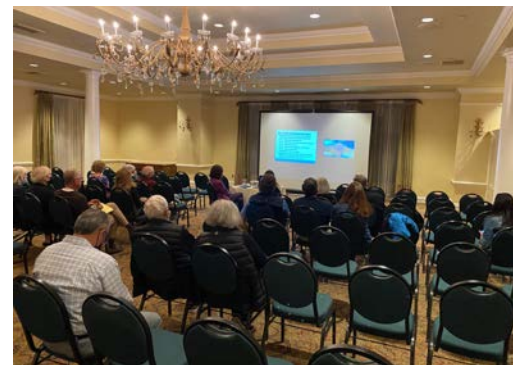
Residents gathered at our Town Hall with county on zoning