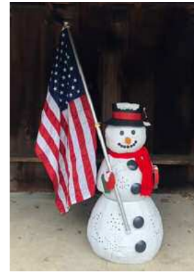
Frosty has been in quarantine for three months and still hasn't had a melt-down.