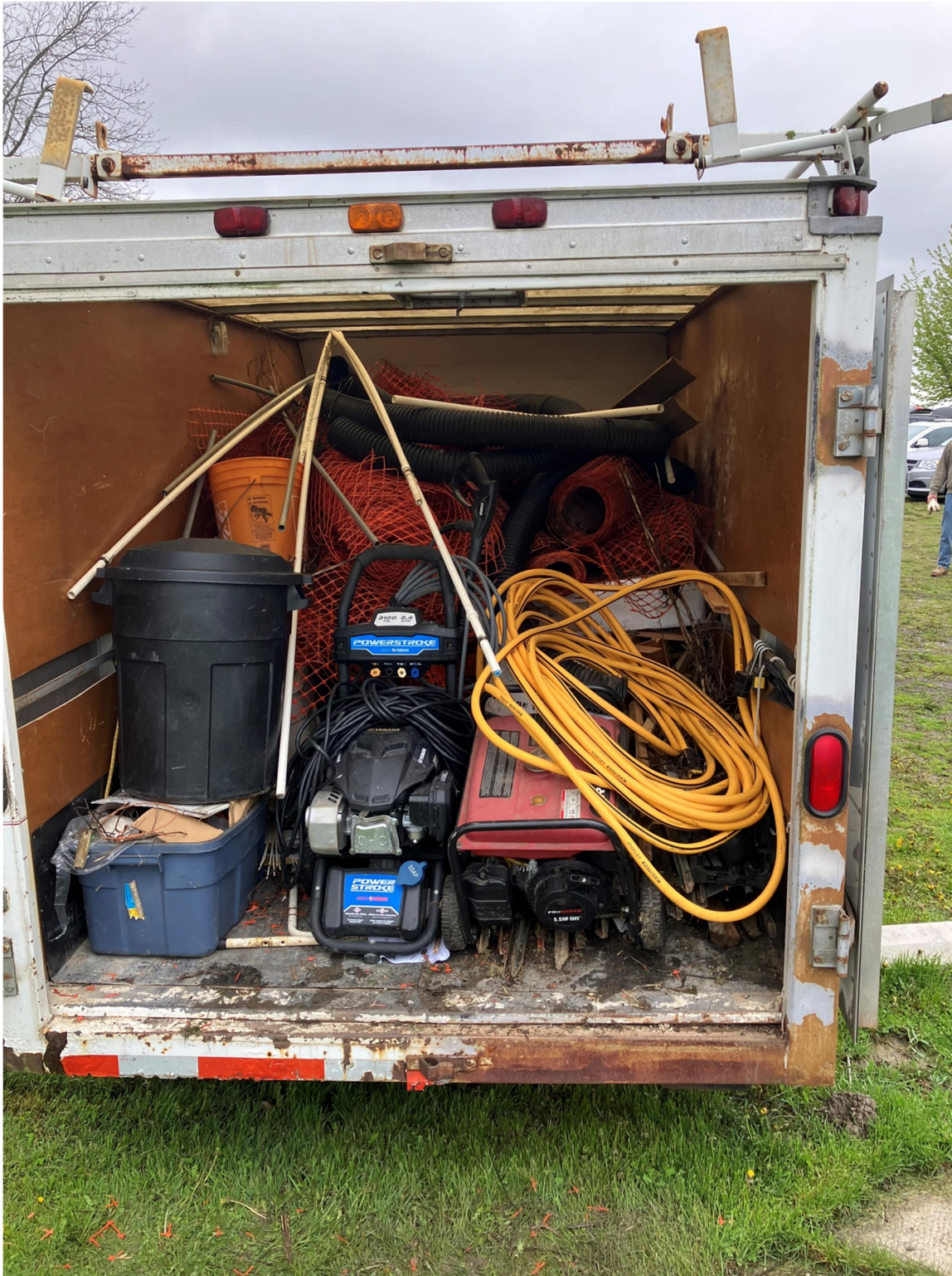
This all came out of the shed.