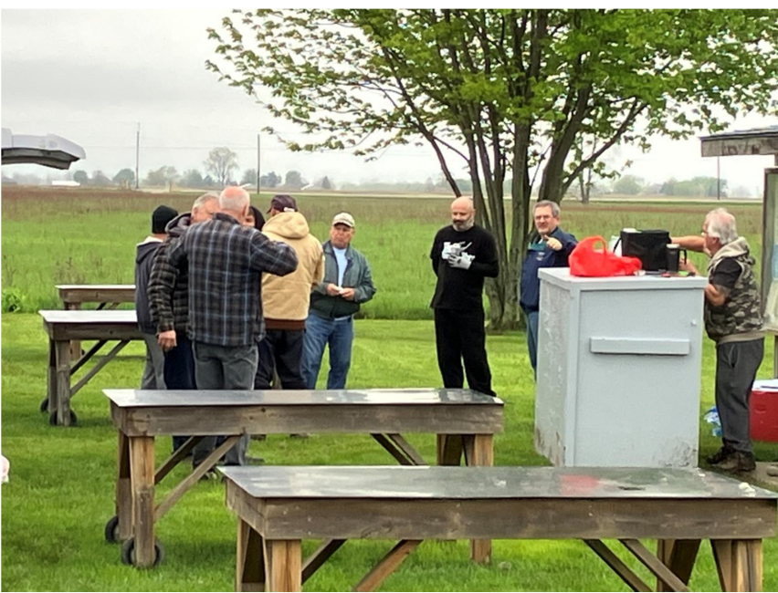
Some of the crew