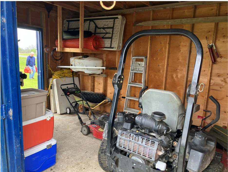
The clean shed.