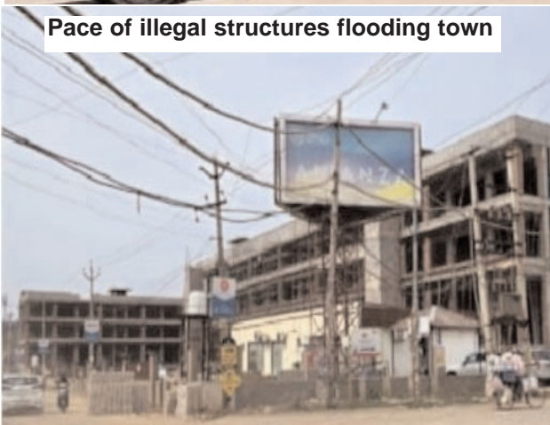
Pace of illegal structures flooding town