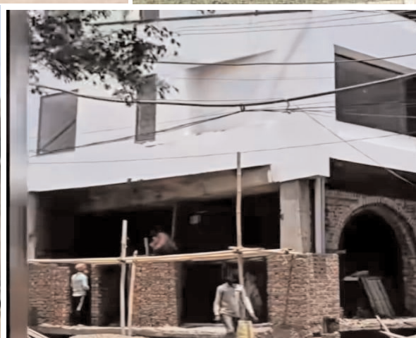
Upcoming Hotel has no architectural approval of RERA