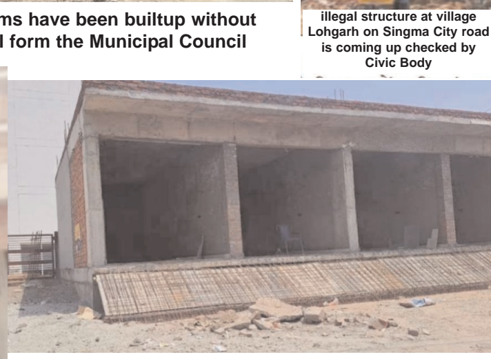
Showrooms by the Royal Apartments are being negnected in Dhakoli