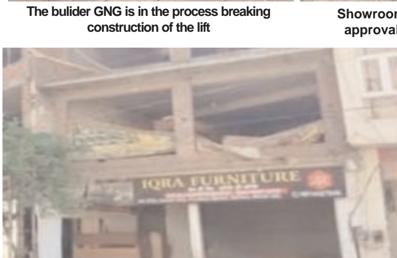
Over Iqra Furniture bulding, an illegal 3 storeyed hotel construction comingup unchecked in Baltana market