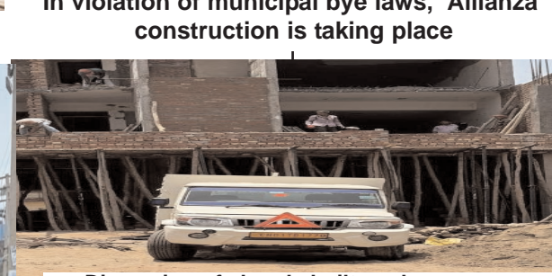
Dimension of already builtup show rooms with the provision lift being enhanced