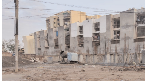
On public road show roome comingup in Dhakoli , SCF 3 Hill View