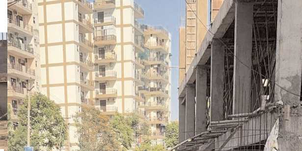
Notice already to unapproved allianza GNG constructions