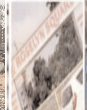
Unapproved structures in Roselyn