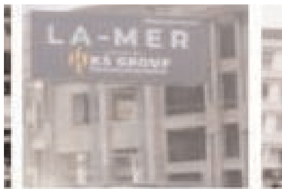
On PR7, spacious construction of illegal show rooms and residential flats are comingup unchecked by Civic Body RERA