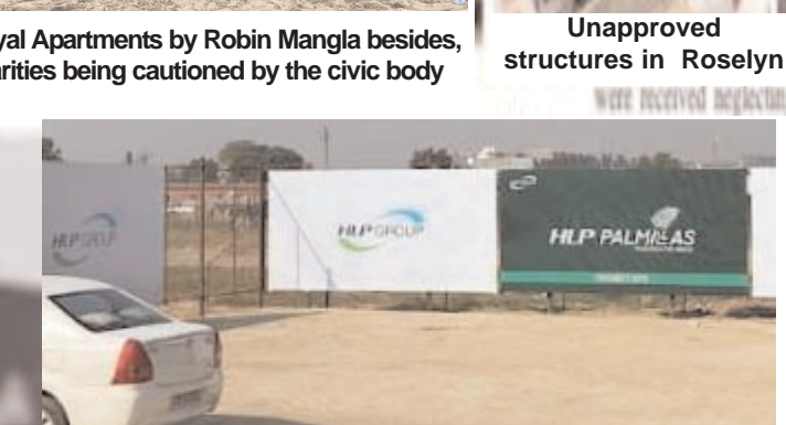
In Ram Pur Bhuda at the close vicinity of VIP road, illegal Residential plots, flats, by HLP palmillas, are being sold