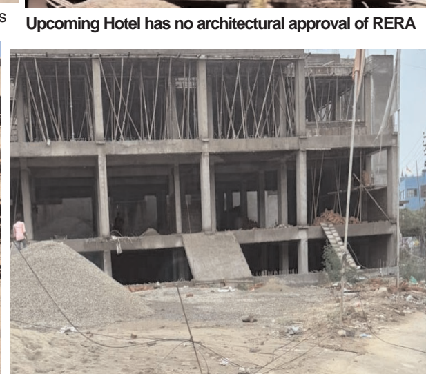
Showrooms have been builtup without approval form the Municipal Council