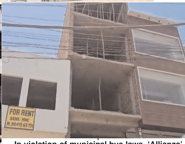
In violation of municipal bye laws, 'Allianza' construction is taking place