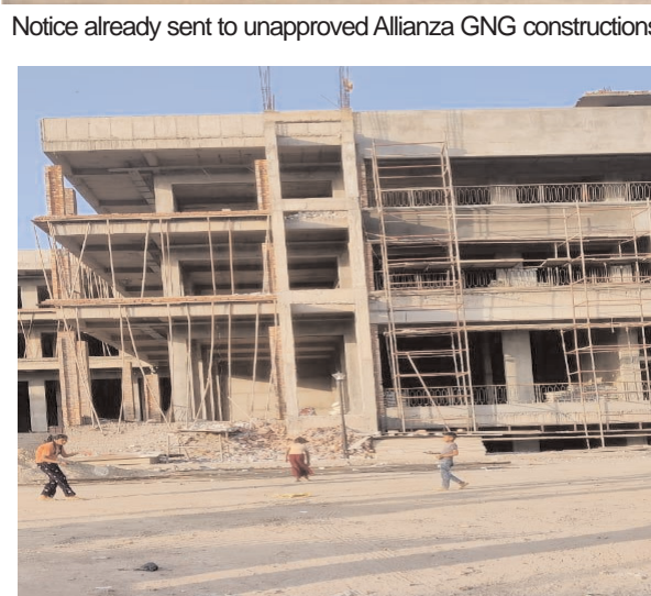
The bulider GNG is in the process breaking construction of the lift