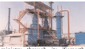
ministry through its 'Samarth Mission' has organised 18 training and awareness programs since October last year for farmers, pellet manufacturers, entrepreneurs and thermal power plant officers in several states across the country. As on July 31, about 35 power plants in the country have co-fired biomass pellets in their units, he added. Biomass is converted into electricity in coal-based thermal power plants in an eco-friendly manner and generate additional income to farmers by consumption of their agro residue. The Union minister said the ministry had issued "policy of Biomass utilization for power generation through co-firing in coal-based power plants" in October 2021 with an aim to use 5-7% biomass for co-firing in all coal-based thermal power plants.

Commissioner News Service CHANDIGARH : R K Singh Union minister of power and new and renewable energy in the Lok Sabha, the total installed capacity of gasifiers in 19 states, including Haryana, is about 1,74,244 kW and 1,710 kW Weq has gone now under construction. Haryana is the only state in the region to have installed biomass gasifier plant with capacity of 6,463 kW (kilowatt equivalent) for power generation from stubble and biomass. Though Punjab produces nearly 20 million tonnes (MT) of paddy residue each year, it does not find mention in the list of 19 state that have either installed or are in the process of installing biomass gasifier plants. Haryana produces nearly 7.5 MT paddy straw annually. Mr R K Singh said in order to develop biomass supply chain infrastructure and to encourage the investors to participate in this sector, the ministry had issued modal long term contract (minimum tenure of 7 years) for biomass supply on March 2, 2022. The Union