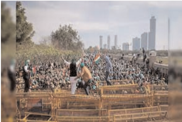
Commissioner News Service

New Delhi: As thousands of farmers marched towards Delhi for a mega protest, the Aam Aadmi Party (AAP) government has rejected the Centre's proposal to turn a stadium into a space to confine them. The Arvind Kejriwal government has said the farmers' demands are genuine and denied approval for "converting a stadium into a jail".