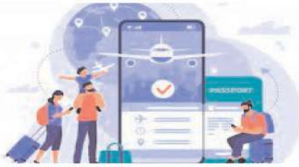
Commissioner News Service