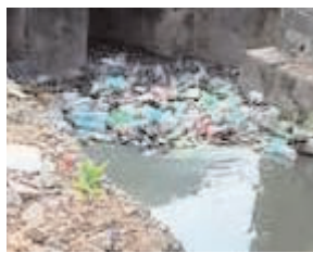
sewage and solid waste. The inspection report of the

Commissioner News Service Chandigarh : The N - choe passing through Mohali district has been continuing its solid waste, sewage which could further aggravate the turmoil. Nevertheless, Chandigarh Pollution Control Committee has plugged the stinking disposal pipes of