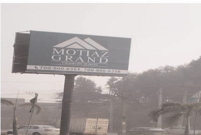
Commissioner News Service

DERABASSI : In the ongoing mushrooming of illegal constructions bereft of approved architectural designs, CLU (Change of Land Use) another housing project of 'Motia Grand' on Barwala road is coming