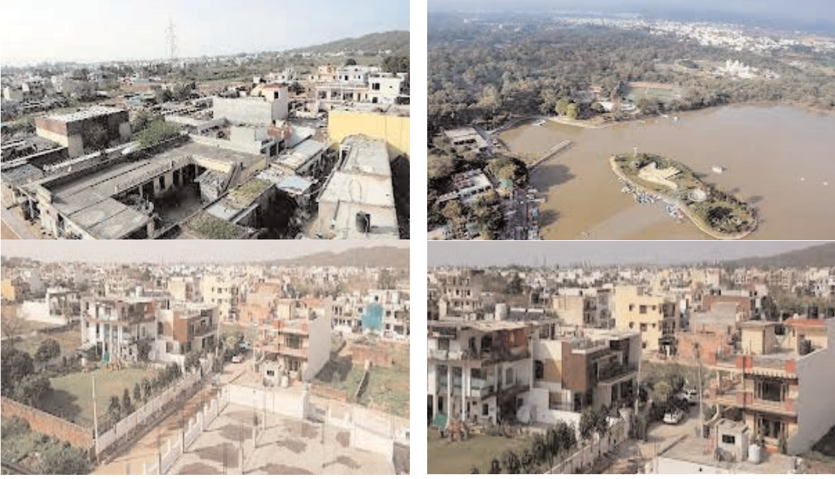
A massive range of more than thousands of illegal structures in the eco sensitive zone along the Sukhna Lake is seen adversely affecting the ecology and environmental fabric in Chandigarh area

This online newspaper is being read internationally on Twitter, Facebook, Instagram, Whatsapp & YouTube