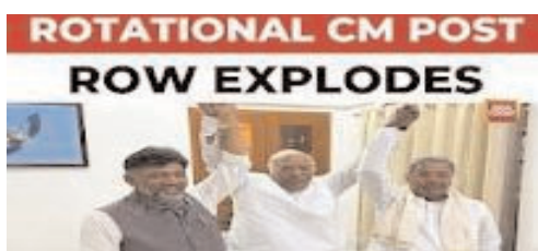
ROTATIONAL CM POST ROW EXPLODES

what they claim was an internal power-sharing arrangement agreed upon in 2023. All the MLAs of Karnataka are mine, claimed Deputy Chief Minister DK Shivakumar. He added that many disgruntled MLAs are racing to meet the head of Congress high command Mr Mallikarjun to place their sentiments.