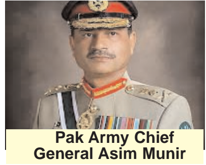
Pak Army Chief General Asim Munir

R.N.I. REGD. NO. 70959/99; (PB) 1048/99; Zirakpur, Wednesday 14th May, 2025 Vol 22, Edition 20 Page 6 Rs 2/-