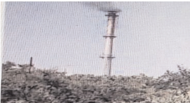
Picture of propagating gases taken on 05.Nov.2024

It may here be underscored that the propagation of green house gases intensifies the germination of various kinds of malaises like diarrhoea cancer, joint pain, asthma, pigmentary disorders, eye inflammation, bronchitis etc. Rather it may be