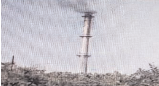
Another image of disseminating gases taken on 26 Nov, 2024