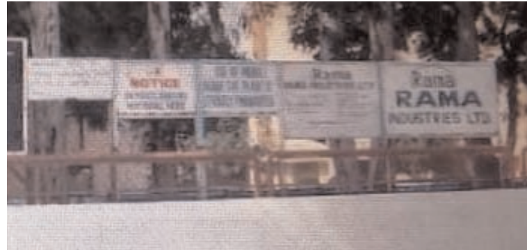
The site of Rama Industries where the auccumbility of pollution rests

The enviromental destruction caused by toxic carbon smoke may be nowadays also witnessed frequently and its consequential dissemination of gases was videographed on 5 Jan , 2024 and also after fortnight gap was again published on 26Nov, 2024 but no action by local senior environmental engineer Rantaz Sharma and Lovneet Dubey at Punjab Pollution Control Board was taken.