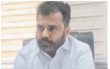
XEN Incharge Pollution Control

Regional pollution control authorities fail to take stringent action against the law offender