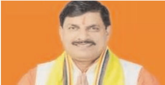
Chief Minister Mohan Yadav

found in ICUs fighting for survival. Elected representatives and officials were seen at loggerheads attributing accountability on one another. Politicos were charging commissioners, secretaries with neglect of sanitation. The ministry of "Jal Jivan" has failed to provide clean water or clean air to the people," said Mallikarjun Kharge, the President of the Indian National Congress. "Clean water is not a