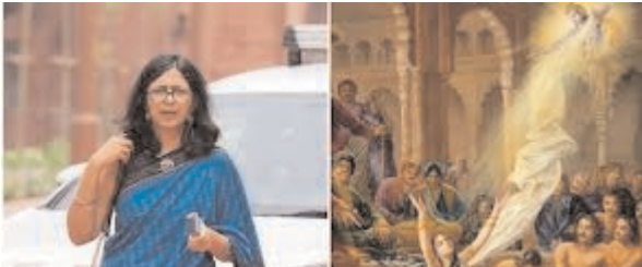
Commissioner News Services

New Delhi : With the BJP poised to form a government in Delhi after more than 26 years, Rajya Sabha MP Swati Maliwal on Saturday took a veiled swipe at the Arvind Kejriwal-led Aam Aadmi Party (AAP) in Delhi. She also posted a painting depicting Draupadi's cheer-haran (disrobing) - a scene from the epic Mahabharata in which Pandavas lost a bet to their usurping cousins. Maliwal had a fallout with the party and its top leader, Arvind