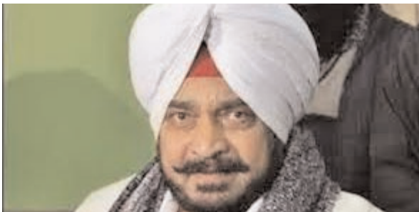
Commissioner News Services

Patiala: Sadhu Singh Dharamsot, congress minister had misappropriated widely the funds meant for development of the constituency. The accused minister had initially redirected the grants of 6.24 crores designated for the rural areas in contravention of the rules and regulation of the municipal council. Certain