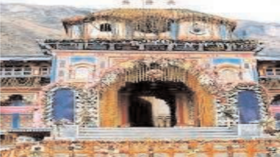
Commissioner News Services