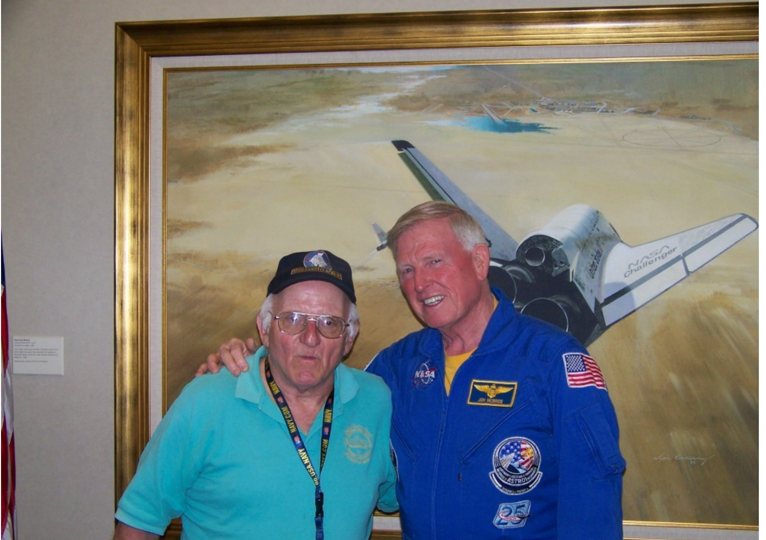
2012 Kennedy Space Center