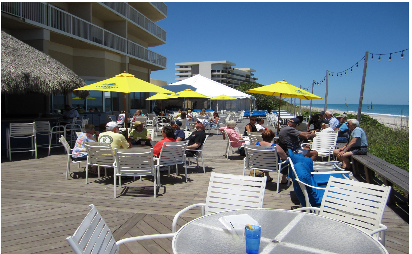
A gathering on the deck