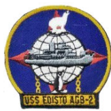
USS EDISTO AGB2