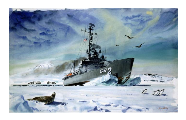
13 x 19 inches