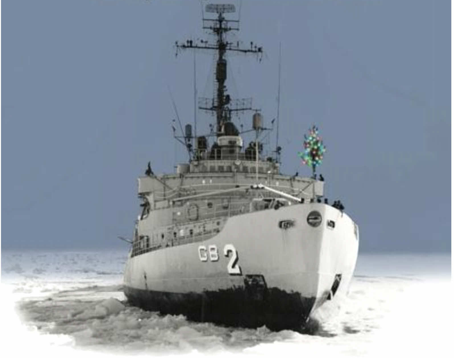
Icebreaker USS Edisto AGB-2 Antarctica, 1962