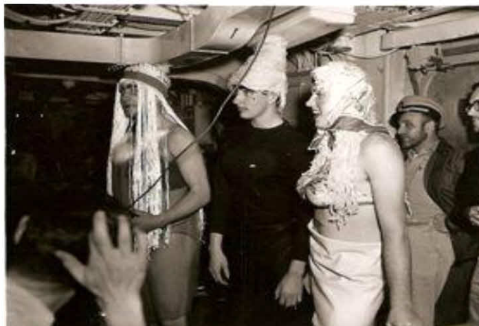
"...The one on the right is reel purty."