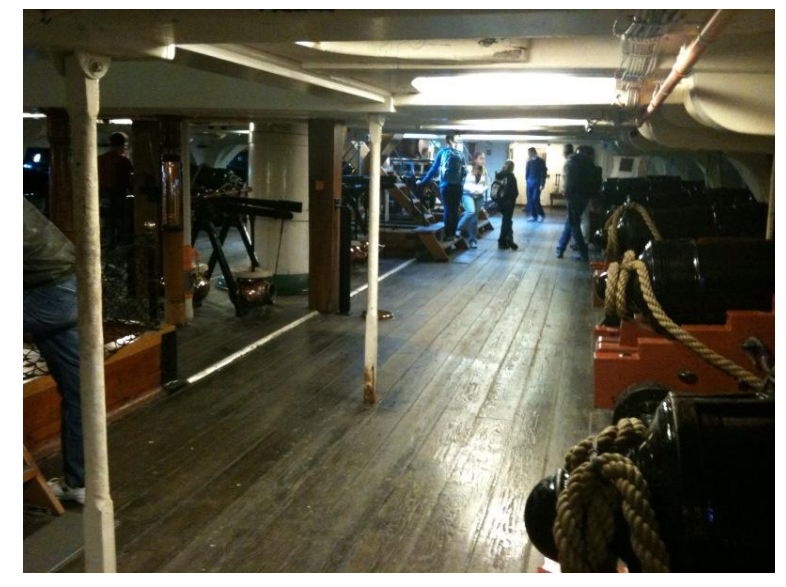
Who says old sailors are not high tech?

Don't forget to checkout your website at: <a href="https://www.ussedistoagb2.com">www.ussedistoagb2.com</a> and the reunion website at: <a href="https://www.windclass.org">www.windclass.org</a>.