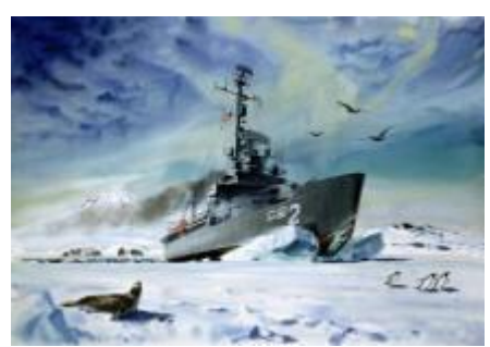
$20 for painting