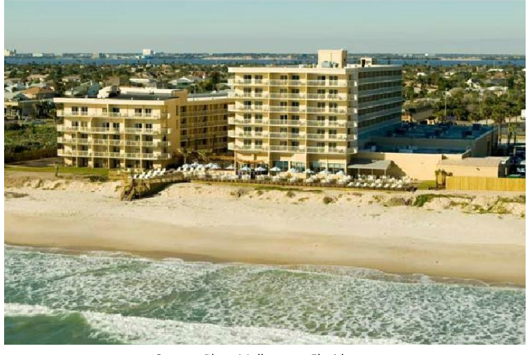
Crowne Plaza Melbourne, Florida

If making reservations online, use Code AGB