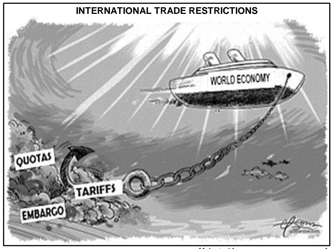
[Adapted from www.guyparsons.com]

4.3 Study the cartoon below and answer the questions that follow.