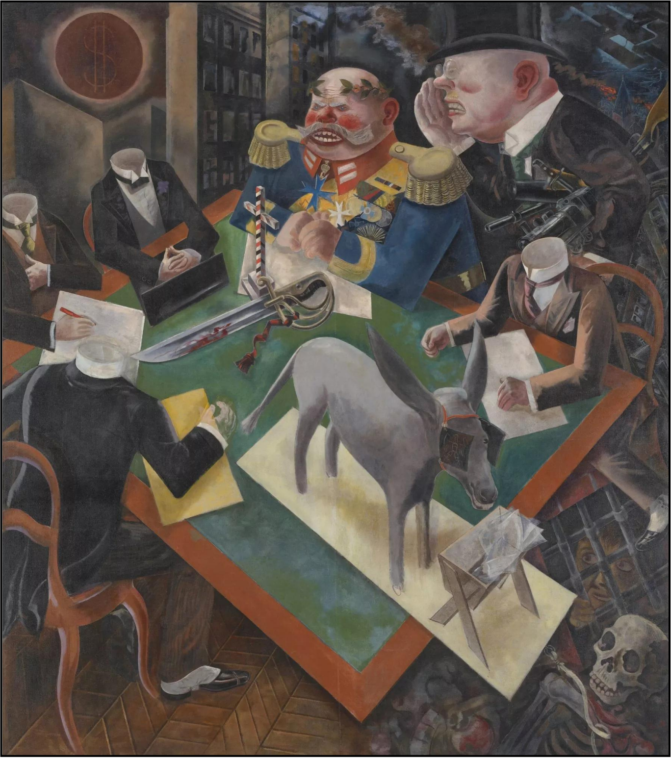
FIGURE 3a: George Grosz, Eclipse of the Sun , oil on canvas, 1926.

Eclipse: An eclipse occurs when one heavenly body, such as a moon or planet, moves into the shadow of another heavenly body.