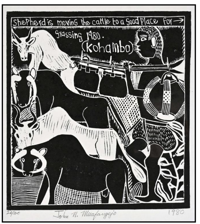
FIGURE 4b: John Muafangejo, Shepherd is Moving the Cattle to a Good Place for Grassing , linocut print, 1980.