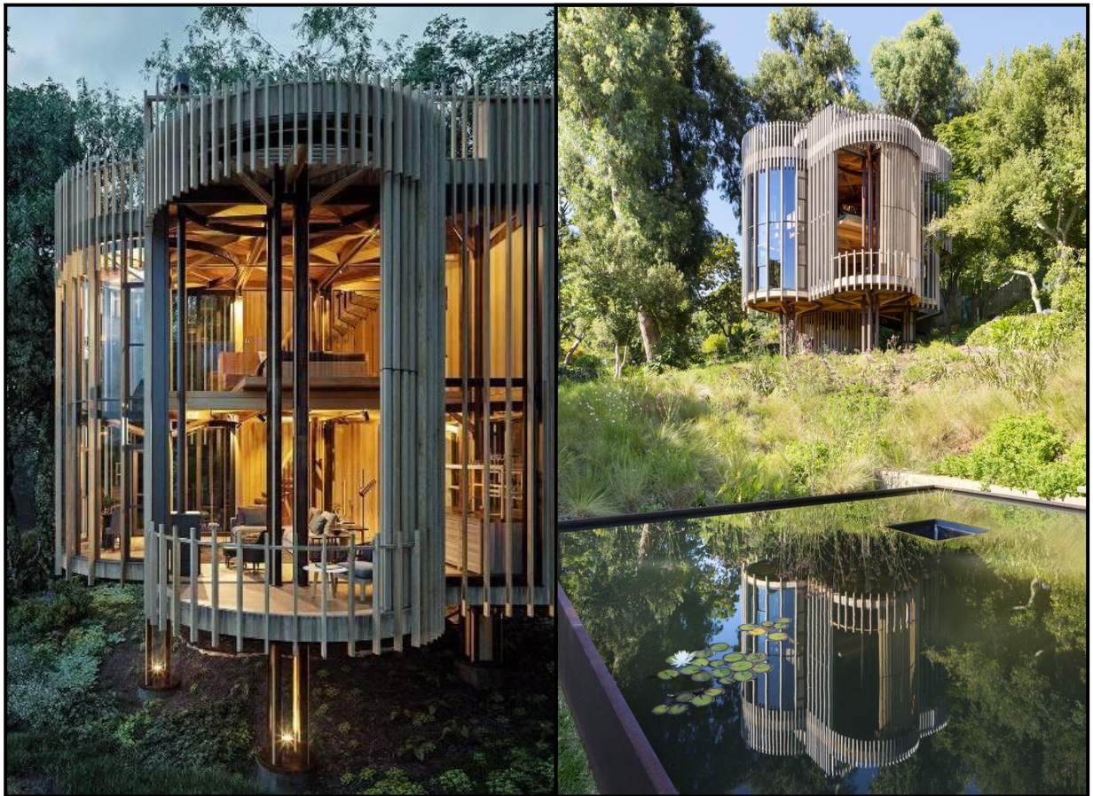
FIGURE 8b: Malan Vorster Architecture Interior Design, Tree House , Cape Town, steel, wood and glass, 2016.