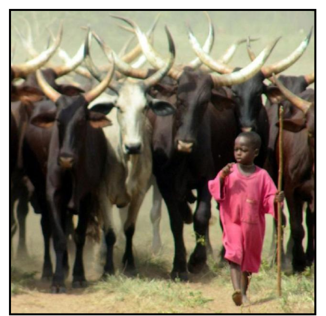
FIGURE 4a: Young Child Herding Cattle , photograph, date unknown.