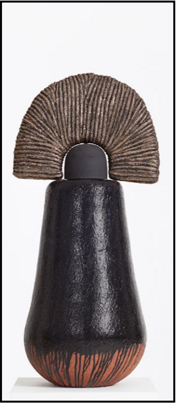
FIGURE 6c: Zizipho Poswa, Natalie Leumaleu , glazed earthenware, bronze, 2022.