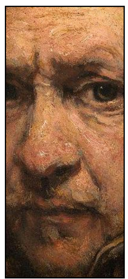
Close-up of FIGURE 5a