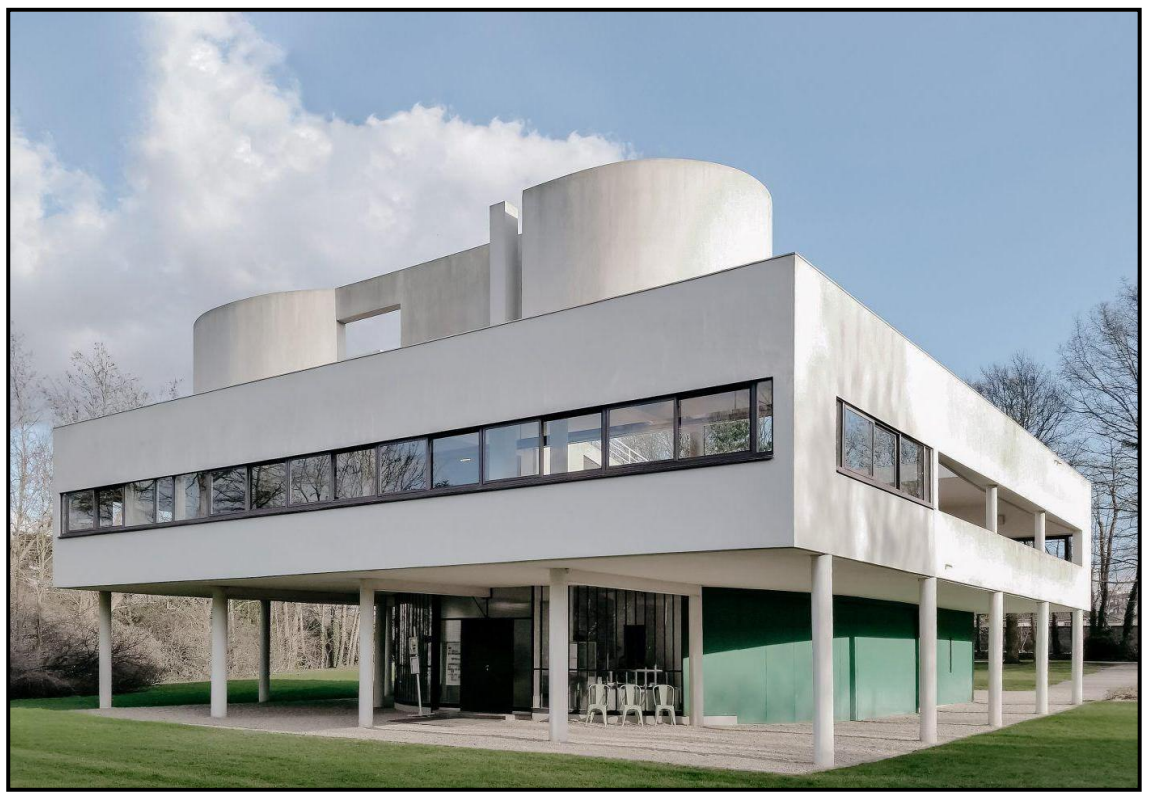
FIGURE 8a: Le Corbusier, Villa Savoye, France, reinforced concrete and glass, 1929.