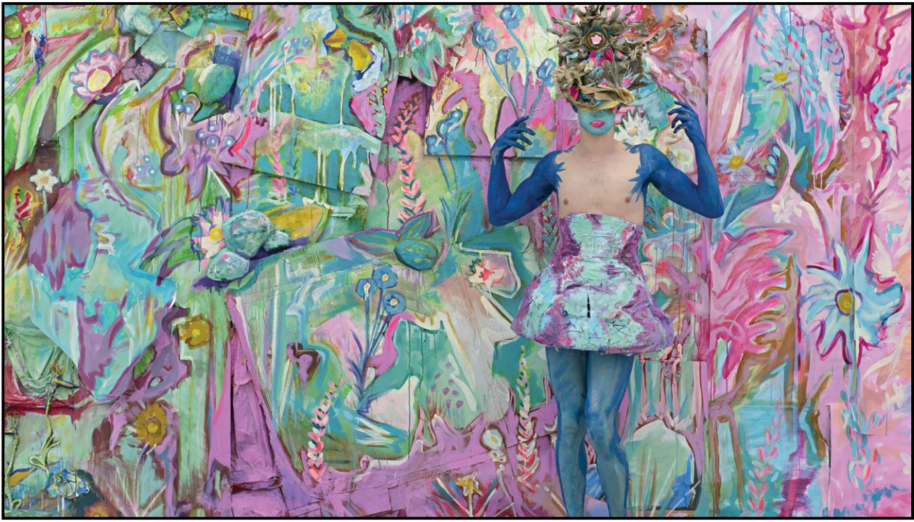
FIGURE 7c: Luke Rudman, Eden and Luke , combination of painting and performance, photograph, 2022.