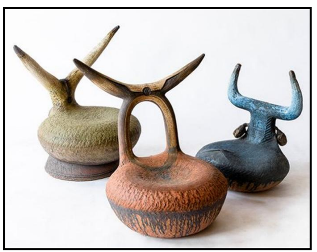
FIGURE 4c: Andile Dyalvane, iThongo Series (ancestral dreamscape), fired clay, 2021.