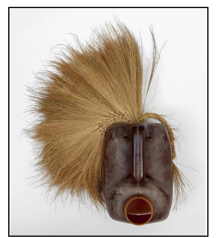
FIGURE 2c: Romuald Hazoumè, Algoma , plastic and raffia, petrol can, 2018.