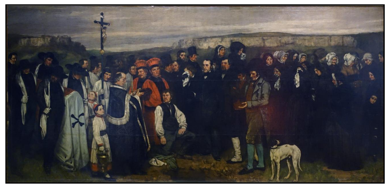
FIGURE 1a: Gustave Courbet, A Burial at Ornans , oil on canvas, 1849–1850.