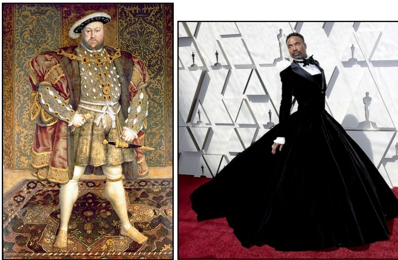
FIGURE 7a: Hans Holbein the Younger, King Henry VIII , oil on canvas, c. 1530.