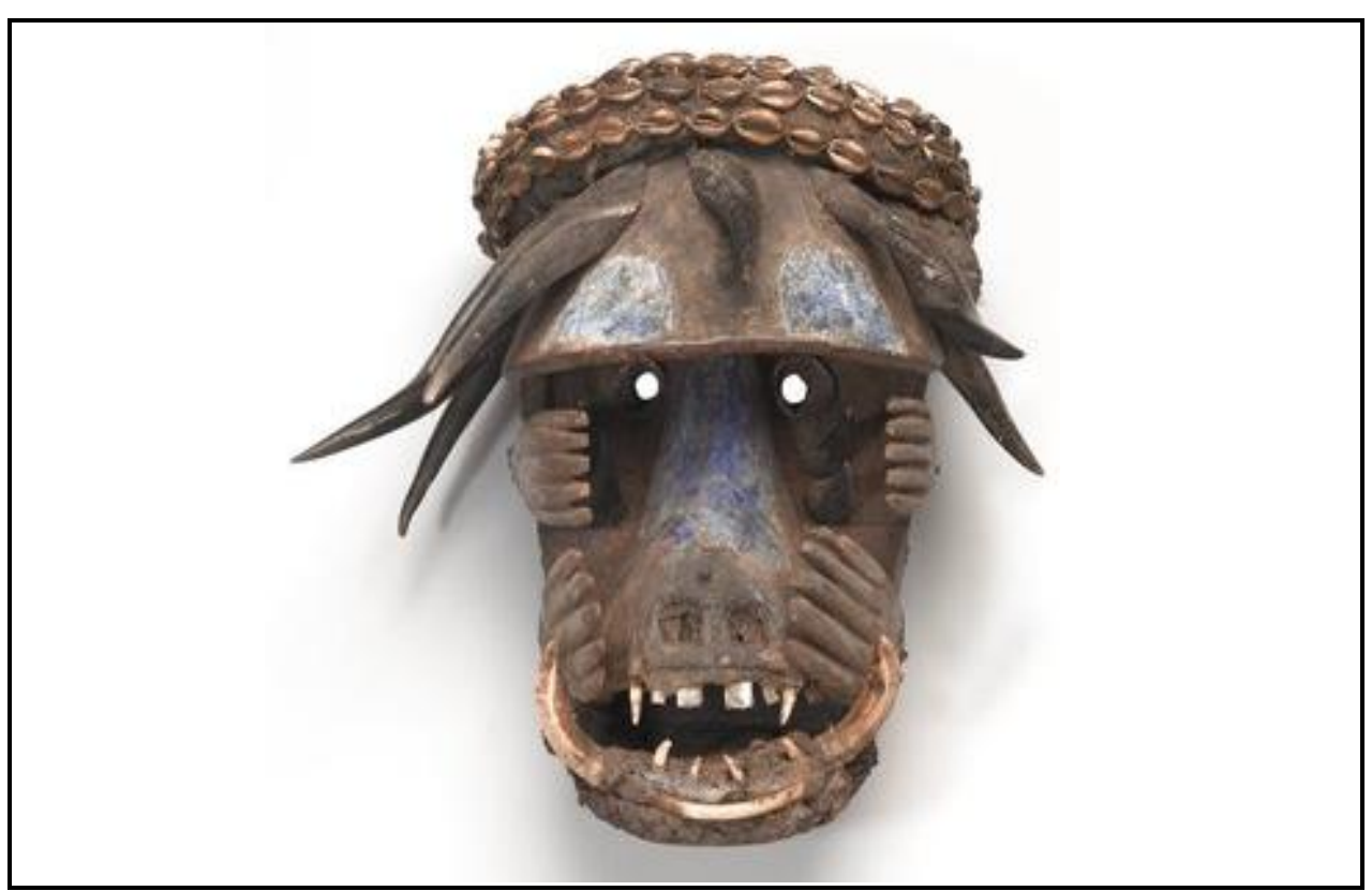
FIGURE 2a: Sapo artist, Sapo Mask , wood, metal, cowrie shells, kaolin, animal teeth, antelope and duiker horn, boar tusk, plant fibres, textile, mud, ceramic, c. 20<sup>th</sup> century.