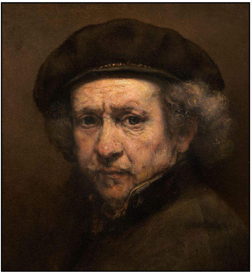
FIGURE 5a: Rembrandt van Rijn, Self-portrait with Beret and Turned-up Collar , oil on canvas, 1659.