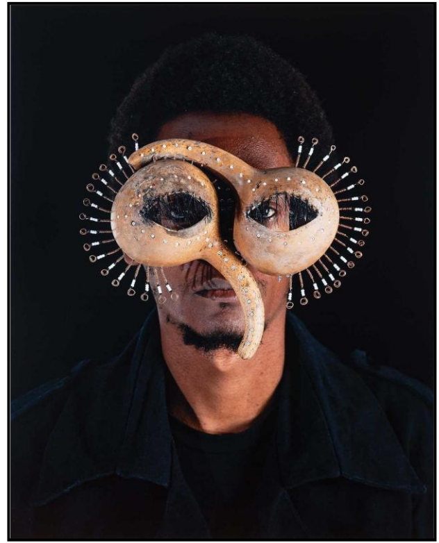
FIGURE 2b: Cyrus Kabiru, Macho Nne 09 ( Caribbean Peacock) , pigment ink on HP premium satin photo paper, 2014.