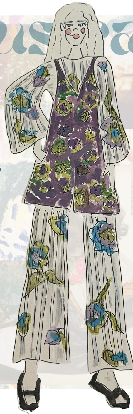
design 12; romper