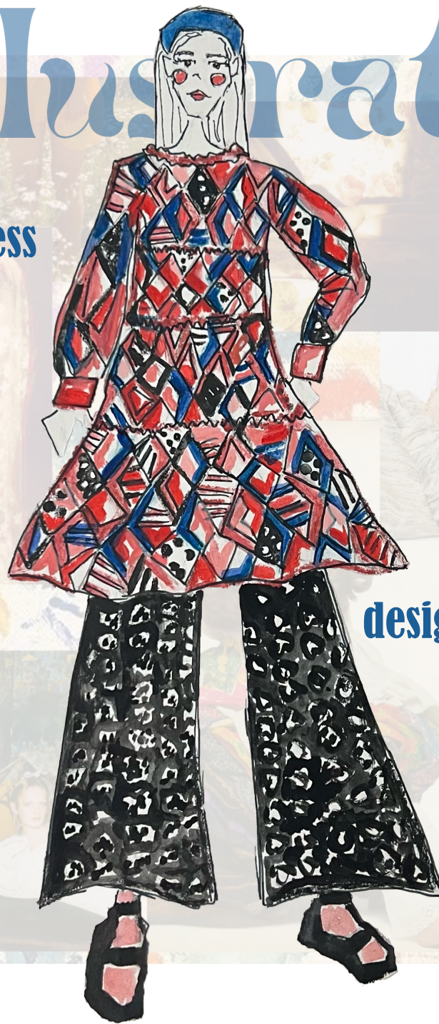
design 2; wide leg pant