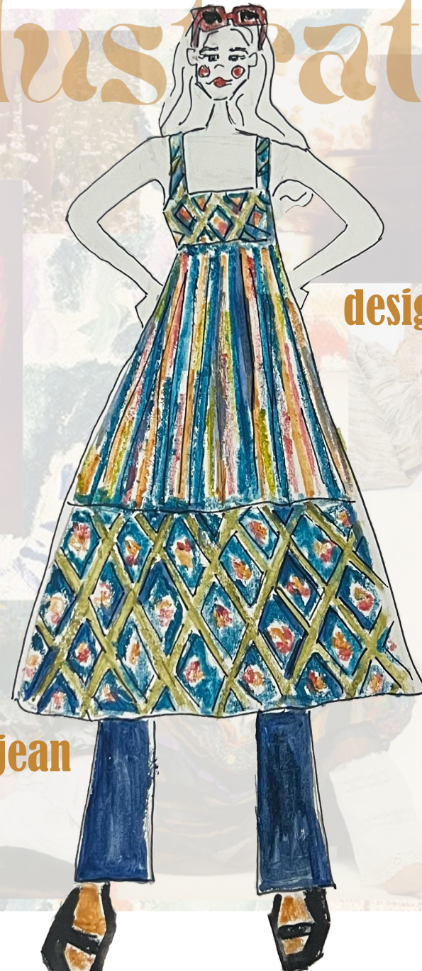
design 4; midi dress