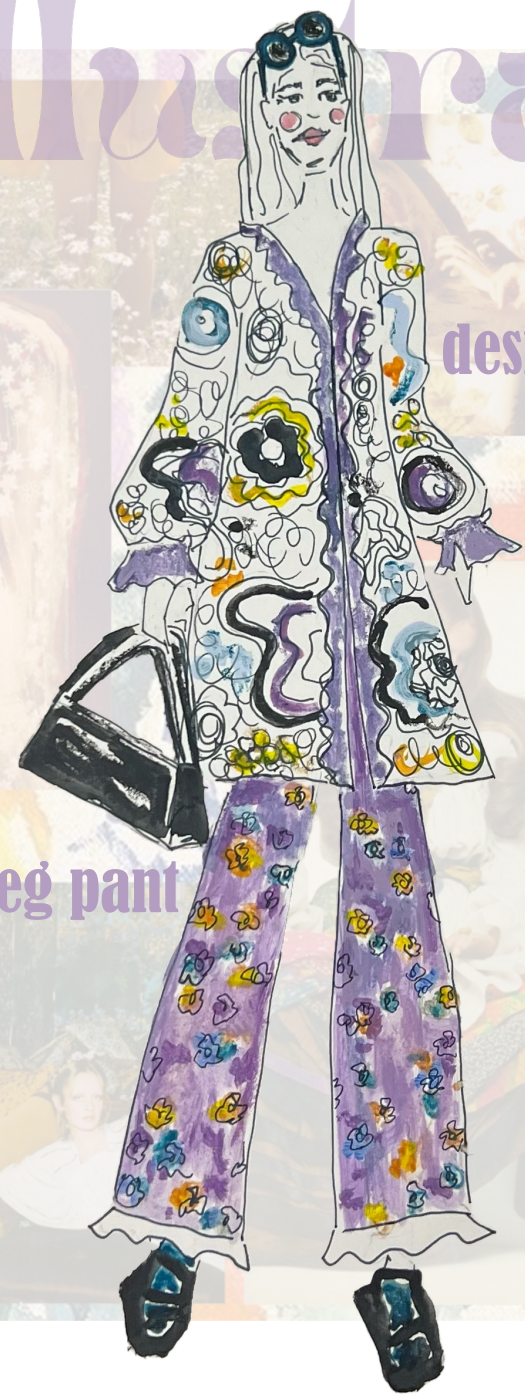
design 7; straight leg pant