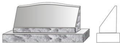
Slant Monument Base styles the same as the monument bases below.