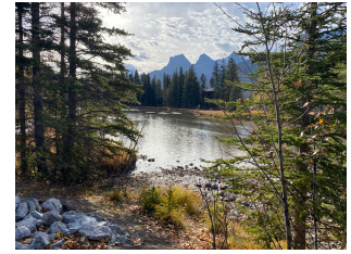
Canmore Trip November 5-10, 2025

SSI Young Artists & Authors Showcase Winners 8/14/25