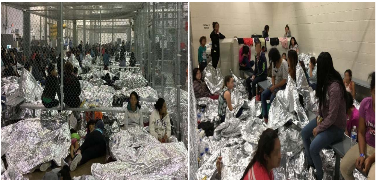
Figure 2. Overcrowding of families observed by OIG on June 11, 2019, at Border Patrol's McAllen, TX, Centralized Processing Center.