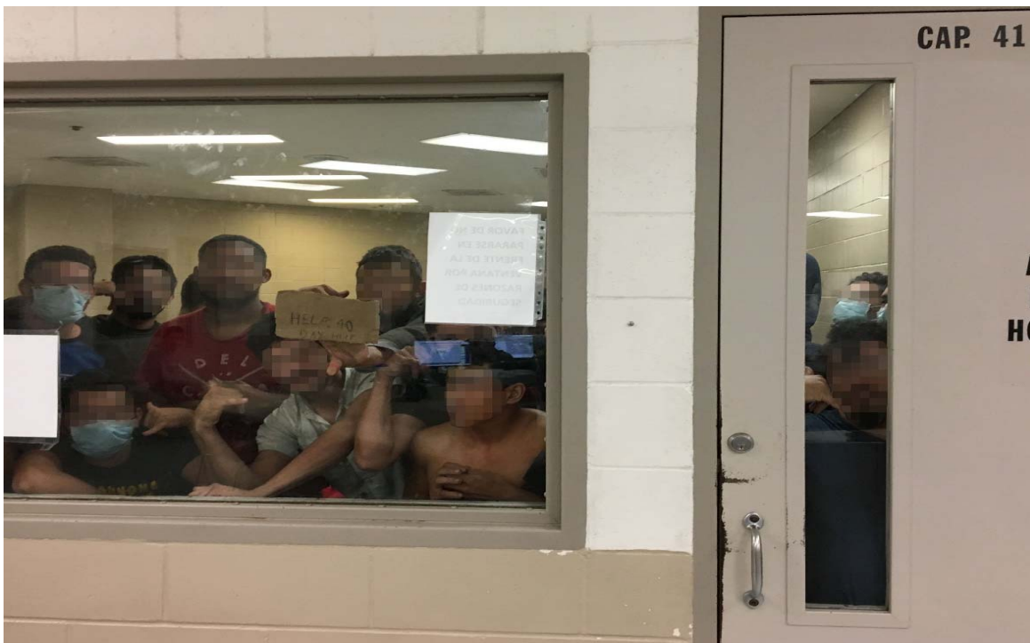
Figure 6. Eighty-eight adult males held in a cell with a maximum capacity of 41, some signaling prolonged detention to OIG Staff, observed by OIG on June 12, 2019, at Border Patrol's Fort Brown Station.

Senior managers at several facilities raised security concerns for their agents and the detainees. For example, one called the situation “a ticking time bomb.” Moreover, we ended our site visit at one Border Patrol facility early because our presence was agitating an already difficult situation. Specifically, when detainees observed us, they banged on the cell windows, shouted, pressed notes to the window with their time in custody, and gestured to evidence of their time in custody (e.g., beards) (see figure 6).