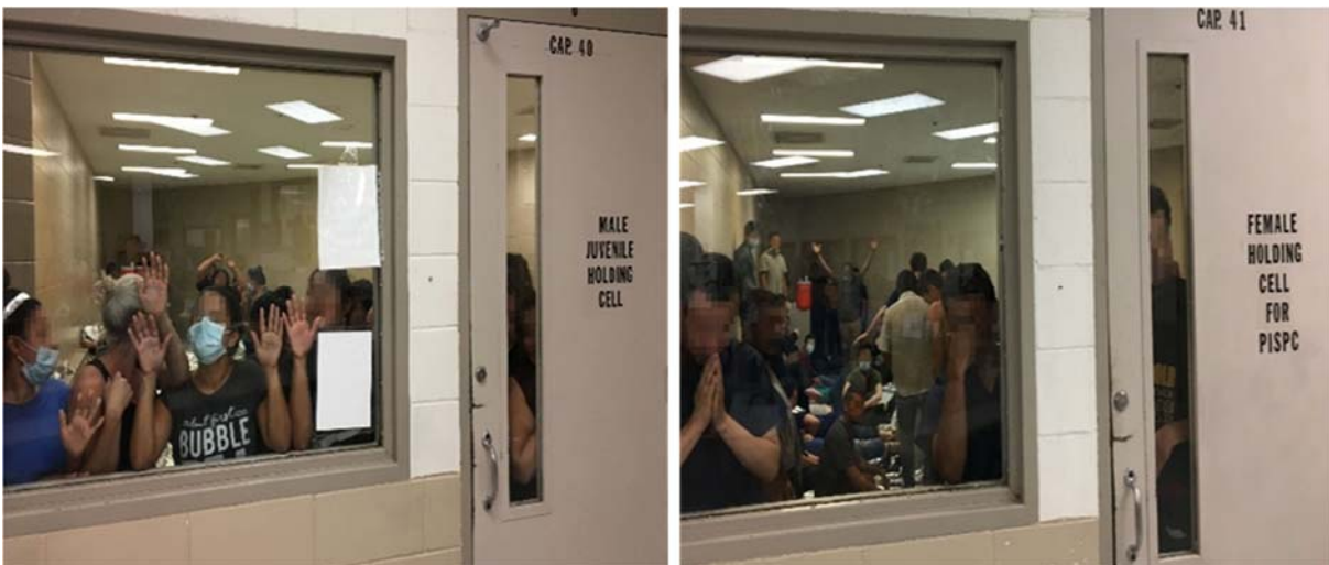
Figure 5. Fifty-one adult females held in a cell designated for male juveniles with a capacity for 40 (left), and 71 adult males held in a cell designated for adult females with a capacity for 41 (right), observed by OIG on June 12, 2019, at Border Patrol's Fort Brown Station.

We are concerned that overcrowding and prolonged detention represent an immediate risk to the health and safety of DHS agents and officers, and to those detained. At the time of our visits, Border Patrol management told us there had already been security incidents among adult males at multiple facilities. These included detainees clogging toilets with Mylar blankets and socks in order to be released from their cells during maintenance. At one facility, detainees who had been moved from their cell