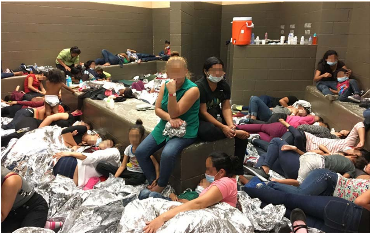
Figure 3. Overcrowding of families observed by OIG on June 11, 2019, at Border Patrol's Weslaco, TX, Station.

In addition to the overcrowding we observed, Border Patrol's custody data indicates that 826 (31 percent) of the 2,669 children 6 at these facilities had been held longer than the 72 hours generally permitted under the TEDS standards and the Flores Agreement. 7 For example, of the 1,031 UACs held at the Centralized Processing Center in McAllen, TX, 806 had already been processed and were awaiting transfer to HHS custody. Of the 806 that were already processed, 165 had been in custody longer than a week.