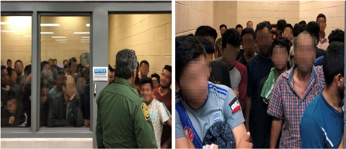
Figure 4. Standing room only for adult males observed by OIG on June 10, 2019, at Border Patrol's McAllen, TX, Station.