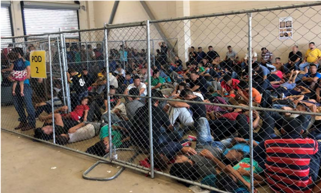
Figure 1. Overcrowding of families observed by OIG on June 10, 2019, at Border Patrol's McAllen, TX, Station.