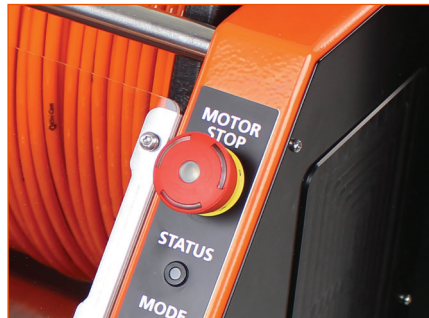
Motor Stop Button

The Joystick remote control is used to control a crawler and motorised cable reel using Bluetooth® wireless technology. The motorised cable Reel can be controlled directly without the presence of the control unit. A handy size and lightweight, the remote control is simple to use and is rechargeable via USB. Supplied with full instructions.