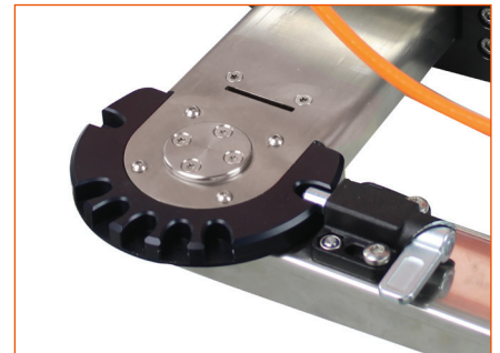
Van Guide Pulley

Additional safety of an instant stop button on the front right hand side of the machine.