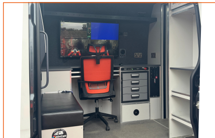
Full Inbuilt Work area