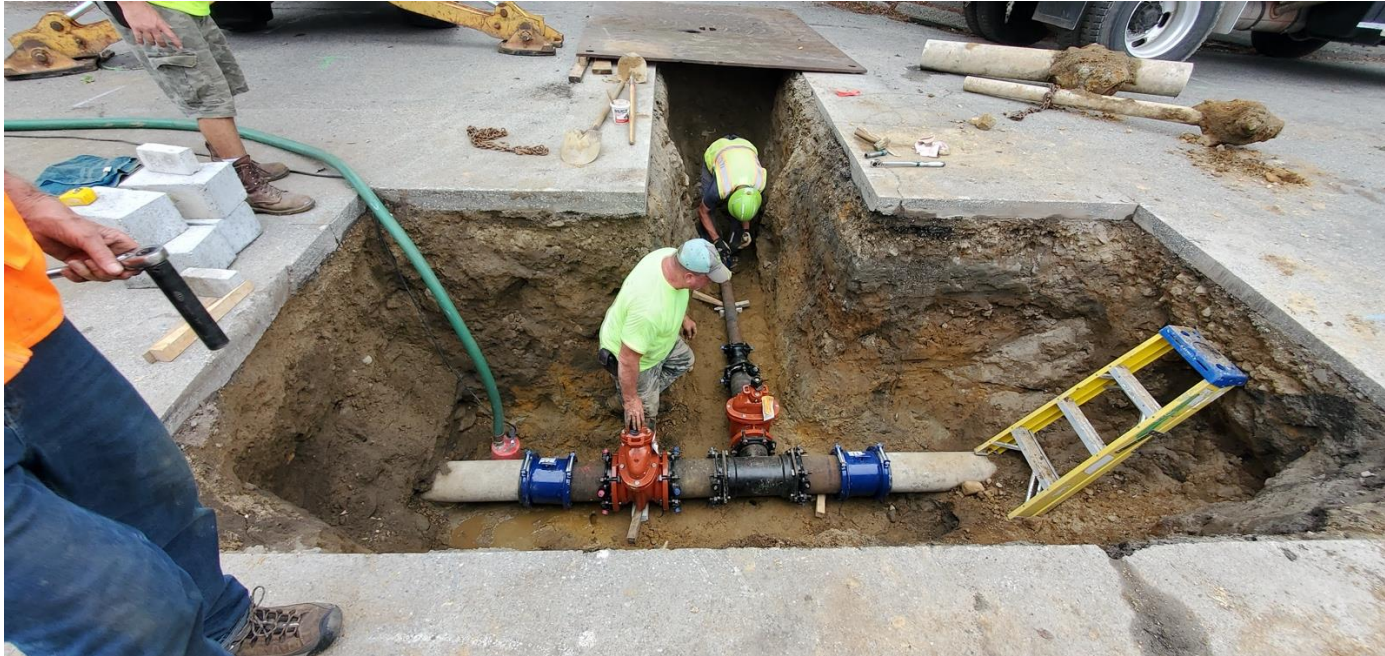
Coupling up, leveling, checking the bedding and set to backfill.

On September 21, 2022 Noank Water Department with the help of Mac Lyon, John Lyon and personnel from Groton Utilities completed the replacement of the 60 year old 3 " Church Street gate valve with a 6" valve, while adding an additional isolation gate valve to the Front Street 8" main.