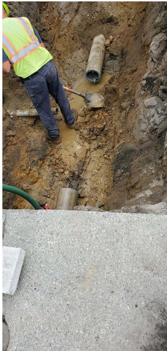
Leveling the base