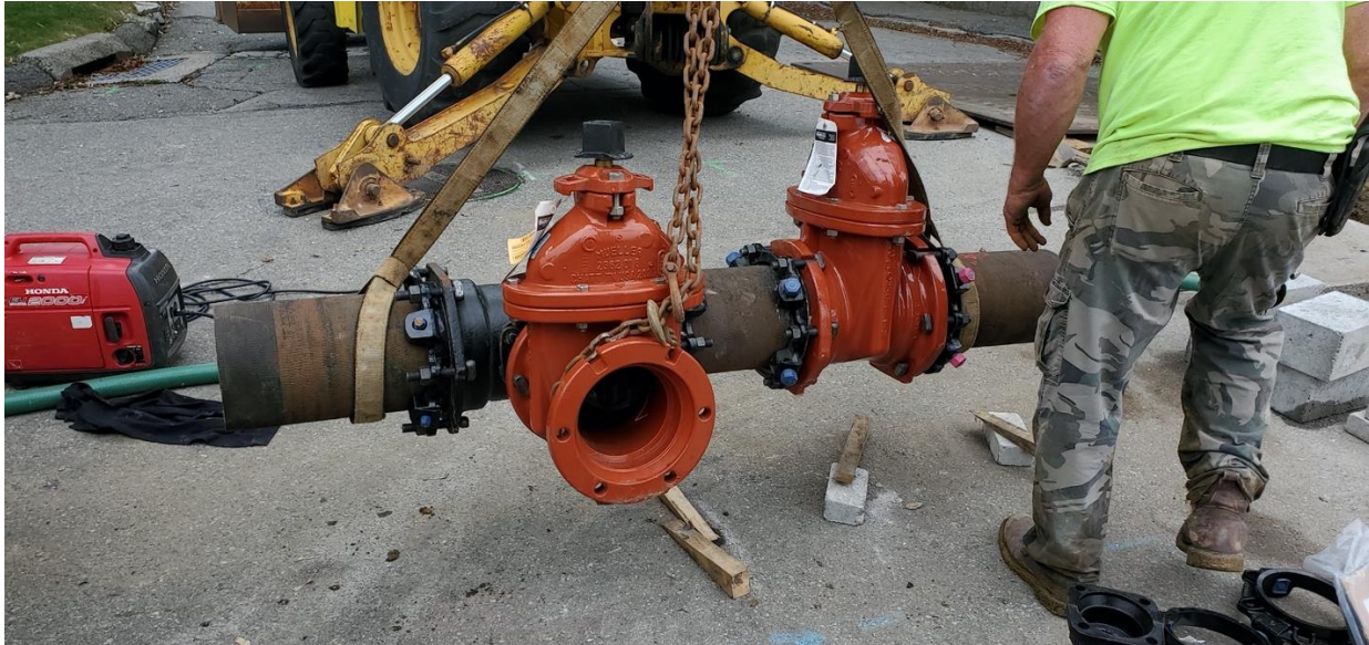
Ward Ave 8" Leg