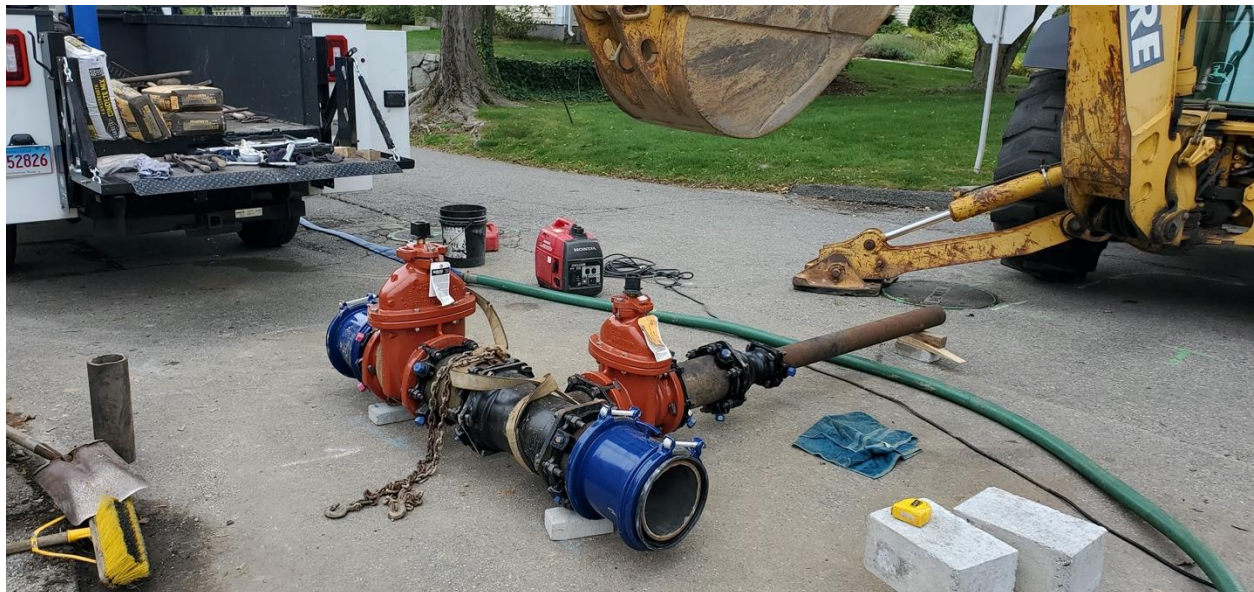
“Double-Gate valve replacement “pre-assembled” & ready to drop into place