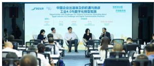
Industry 4.01 Investment event in Shanghai with more than 150 investors