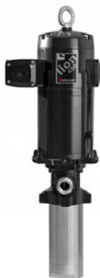
Lion™ 450 3:1