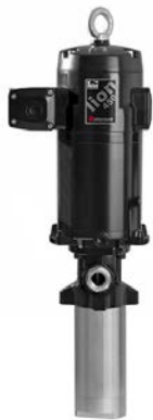
Lion™ 450 6:1