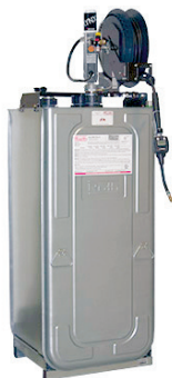
Low Volume Solutions