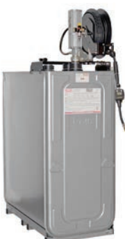
Medium Volume Double Wall Tank Solutions