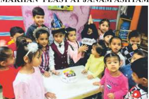
BIRTHDAY CELEBRATION FOR KIDS