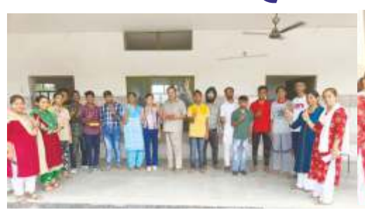
100% RESULT OF CLASS 10

चिकित्सीय तथा अभियांत्रिकी महाविद्यालयों में एवरैस्ट विद्यालय में अभिभावकों के साथ उनके तथा विदेश के उच्च शिक्षा संस्थानों में प्रवेश बच्चों की समस्याओं पर नियमित रूप से