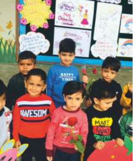
CHILDREN DAY CELEBRATIONS