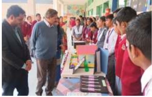
SCIENCE FAIR AT SCHOOL