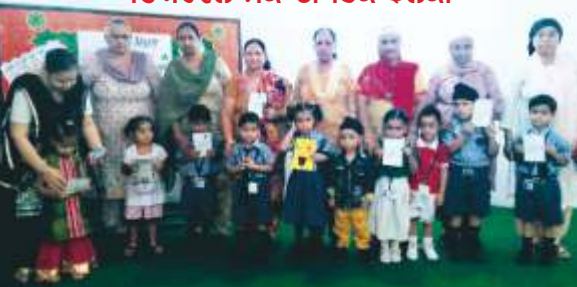
ਰਿਸ਼ਤਿਆਂ ਦੀ ਕੀਮਤ ਸਮਝਾਂਦਾ – ਗਰੈਂਡ ਪੇਰੈਂਟਸ ਦਿਹਾੜਾ