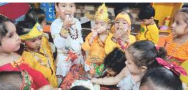
'MAKHAN' FEAST AT JANAM ASHTAMI