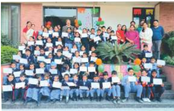
SCIENCE FAIR WINNERS