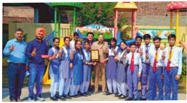
TROPHY IN JUDO