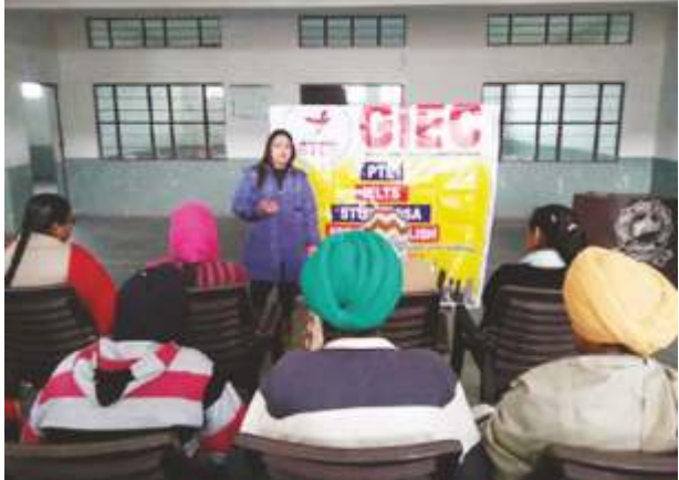
STUDY VISA ਰਾਹੀਂ ਵਿਦੇਸ਼ ਜਾਣ ਦੀ ਜਾਨਕਾਰੀ ਲੈਂਦੇ ਵਿਦਿਆਰਥੀ