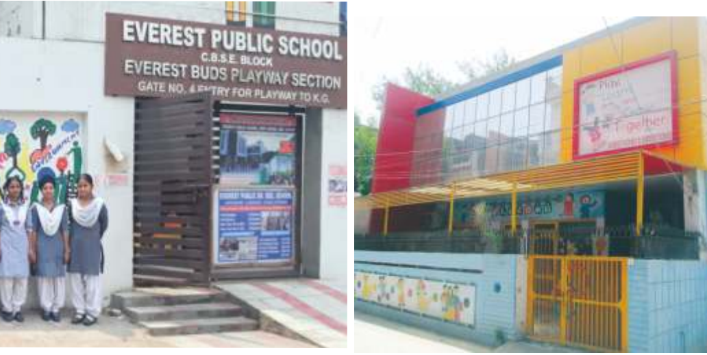
Playway Inside Moti Nagar Campus