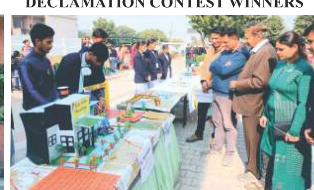
SCIENCE FAIR GLIMPSE