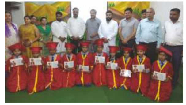
ਰਿਸ਼ਤਿਆਂ ਦੀ ਕੀਮਤ ਸਮਝਾਂਦਾ – ਗਰੈਂਡ ਪੇਰੈਂਟਸ ਦਿਹਾੜਾ