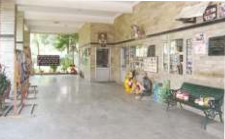
Administration Block, Moti Nagar