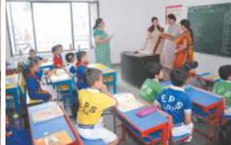
Class Room Junior