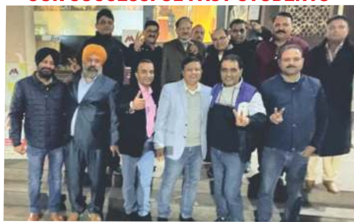
EVEREST GROUP OF INSTITUTIONS boastes of a long list of highly successful allumini in different fields of life. A group photo of our allumini students that includes Global leaders, Doctors, Engineers, Chartered Accountants, Lawyers, industrialists and so on.