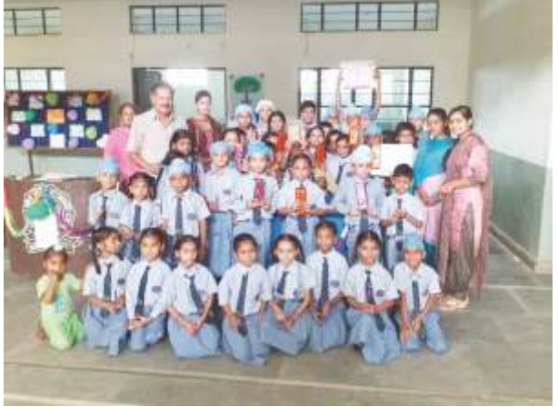
ਸਕਲ ਦਿਹਾੜੇ ਦੌਰਾਨ ਇਨਾਮ ਜਿੱਤਣ ਵਾਲੇ ਵਿਦਿਆਰਥੀ