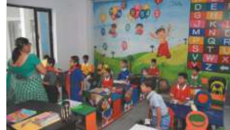
Class Room Playway