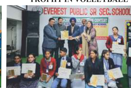
DECLAMATION CONTEST WINNERS