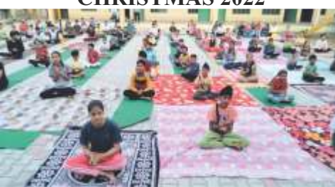
YOGA CLASS AT SUMMER CAMP