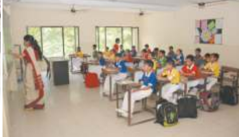
Class Room Senior