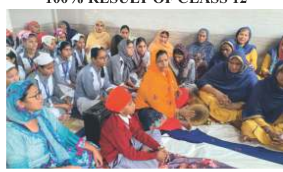
SUKHMANI SAHIB KIRTAN