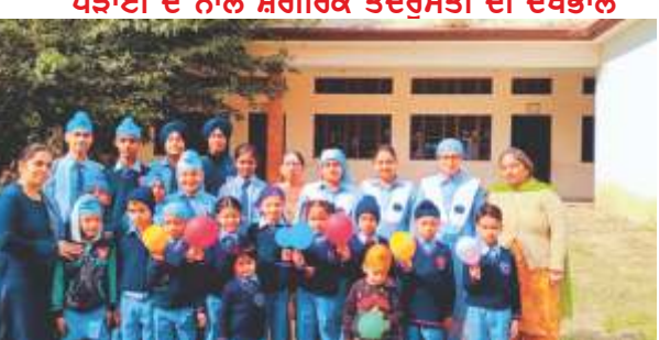
ਬਾਲ ਦਿਵਸ ਅਤੇ ਹਰ ਦਿਨ ਤਿਓਹਾਰਰਾਂ ਦੀ ਜਾਨਕਾਰੀ