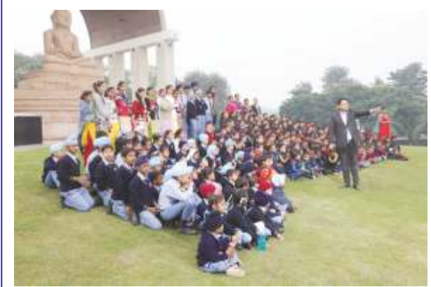
ਸਕੁਲ TOUR ਵੇਲੇ ਦੁਨਿਆ ਦੀ ਜਾਨਕਾਰੀ ਲੈਂਦੇ ਵਿਦਿਆਰਥੀ