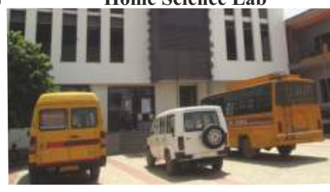
Own Buses, Quality Drinking Water & Soon coming solar Lighting