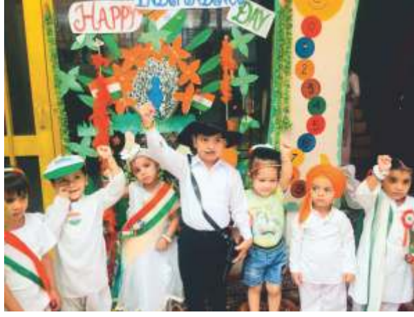
INDEPENDENCE DAY CLEBRATIONS