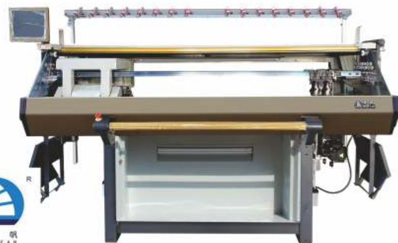
Computerized Flat Knitting Machine (18 Gauge D2)