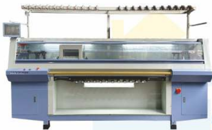
Whole Garment Knitting Machine