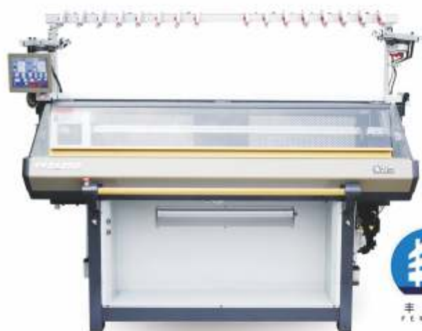
Computerized Flat Knitting Machine (10 Gauge)

Dana Mandi, Bahadur Ke Road, Nr. Jalandhar Bye Pass, Ludhiana, India