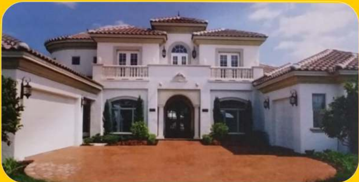
Anami House, Jeewan Nagar Chowk Focal Point, Ludhiana.