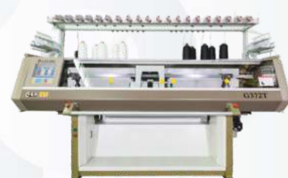
Gold Plus Speediii

We would wait for your gracious presence