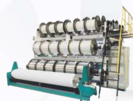
Warp knit Machine