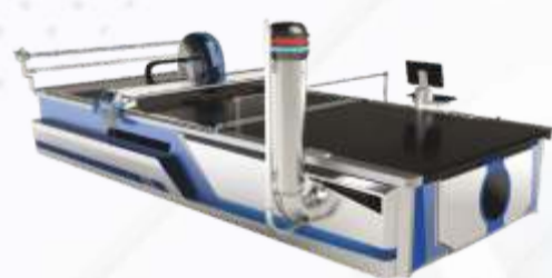
Fabric Cutting Machine